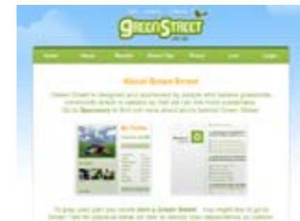
Samford has its own group on the Green Street website and has been instrumental in promoting household sustainability, community group action and business sustainability, including networking the community to help during the Brisbane floods.