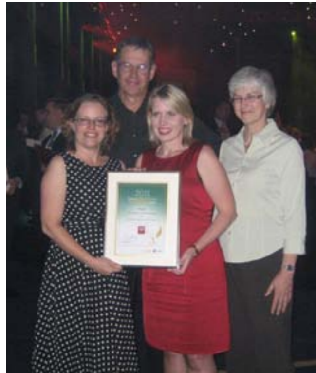
Samford Green Street was the featured project in the winning of the Premiers Community Climate Smart Award in 2010 by the Pine Rivers Climate Action Network

Community-based groups and government agencies have carried out a number of activities in recent years aimed at developing a more sustainable Samford Valley.