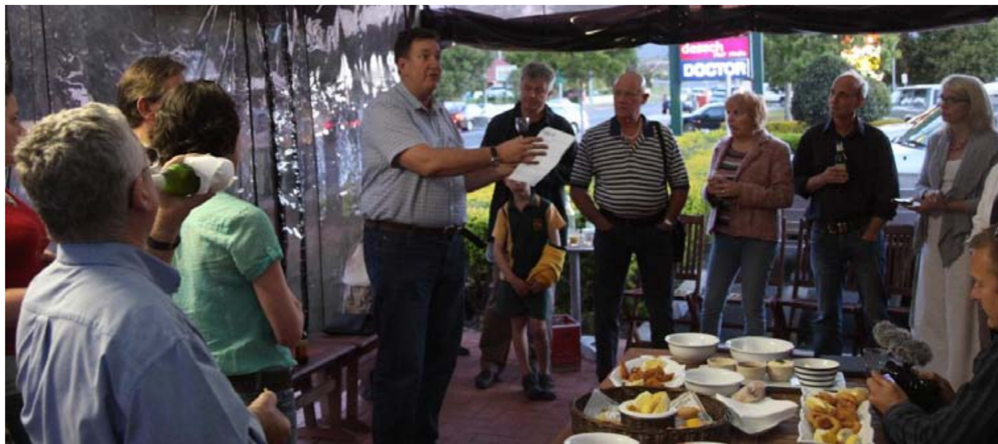
The Samford Sustainable Business Precinct was launched in 2011 as a partnership of the Samford Chamber of Commerce and Samford Green Streets.