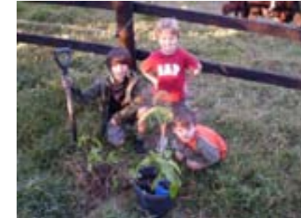
Three Samford youngsters doing their best for their school in the Samford Green Street School Challenge, which involved engaged hundreds of households in 'having a go at being sustainable'.