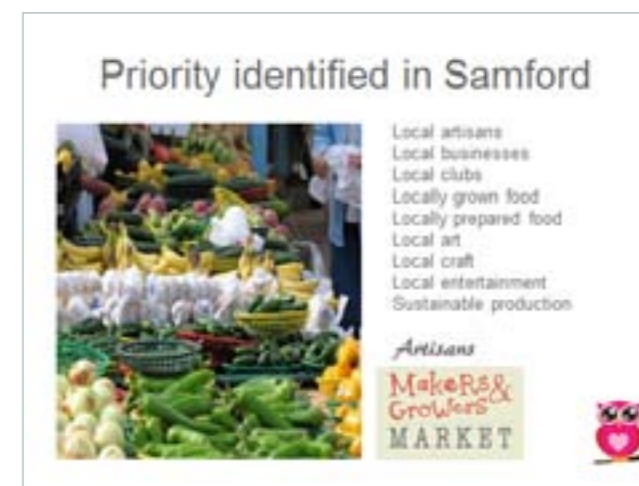
Twilight markets are proposed to begin in 2013